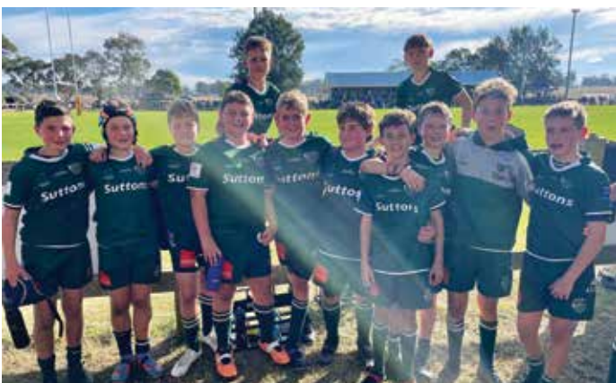
Well done to the Eagles U12s team who represented Randwick in the state championships in Camden in June 2023