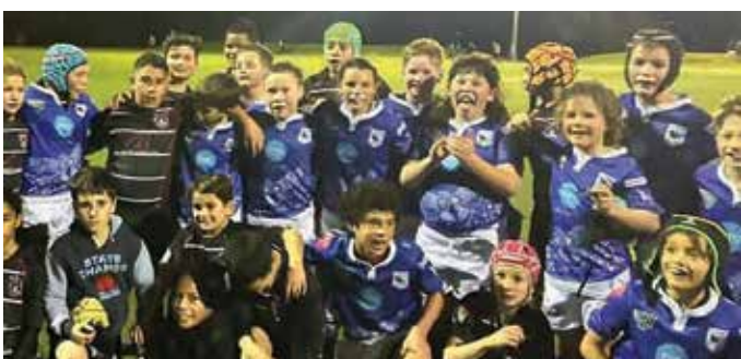
Clovelly Eagles JRFC

Of course, we also had to defend. Which we did most of the time, except for the occasional spell when we forgot to tackle and would leak a few tries that we then had to chase the game. Fortunately, we always leant in and worked together to get out of trouble. Finishing the season really strongly with only 1 loss, we were primed to go deep into the season.