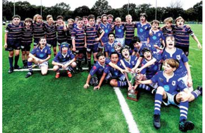
Clovelly U10 defeated Easts – 26 to 21