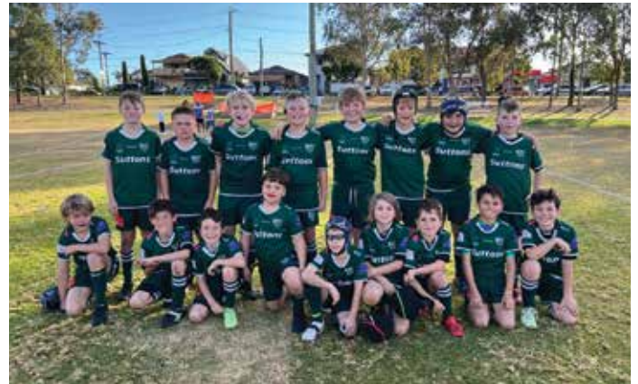
Randwick Representative Team U10 White