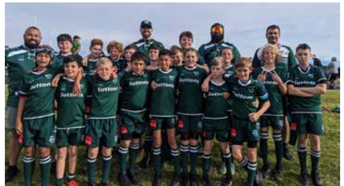
Randwick Representative Team U11 White