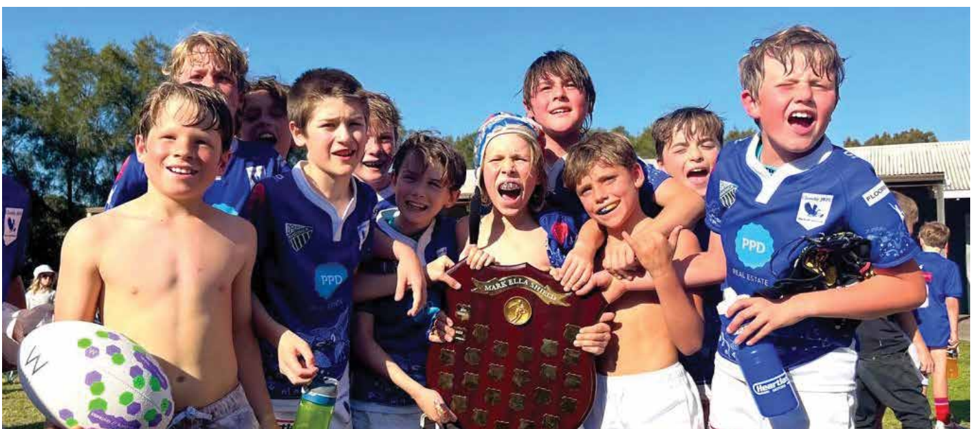
Clovelly U10 defeated Terrigal – 20 to 19