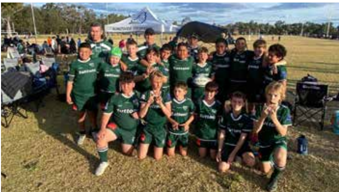
Randwick Representative Team U11 Green