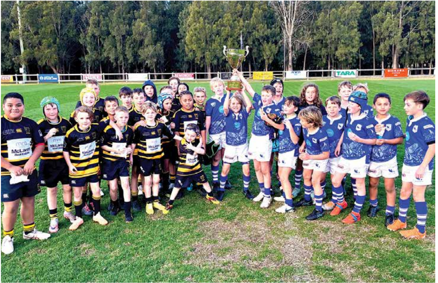
Clovelly U10 defeated Camden – 34 to 27