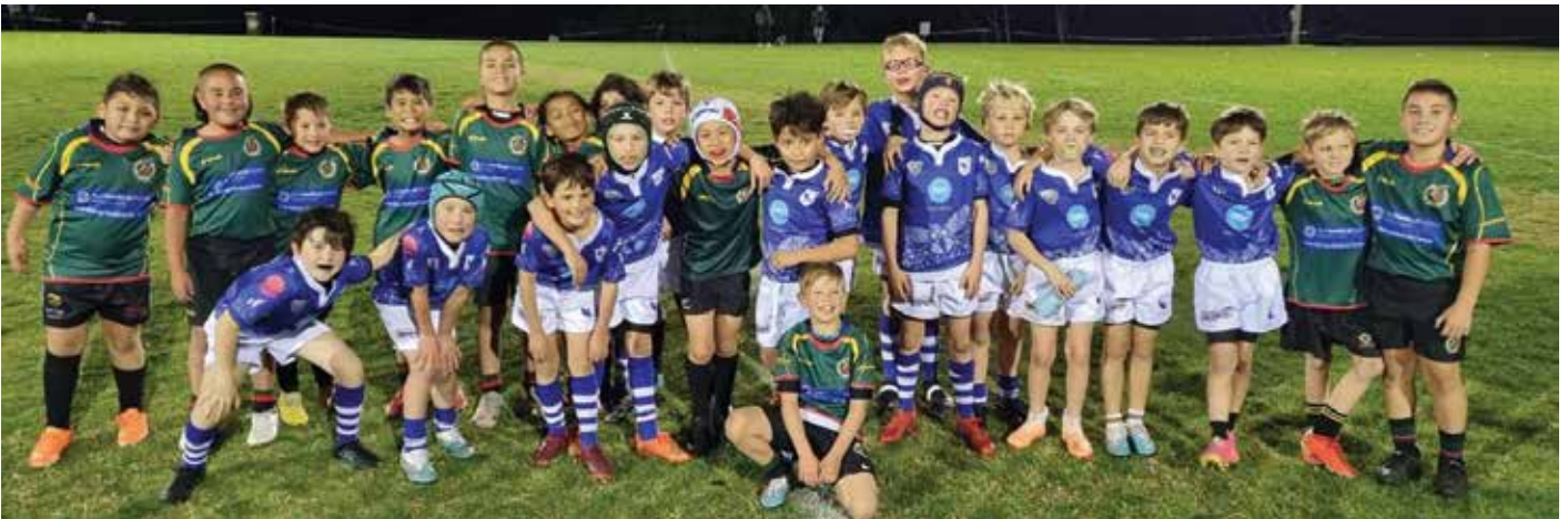
U9s with Dufficy Cup winners Western Raptors

Dufficy Cup was held on a cold Friday night in August and was a great chance for our U9s to get their first tastes of Friday night rugby and U10 rules!