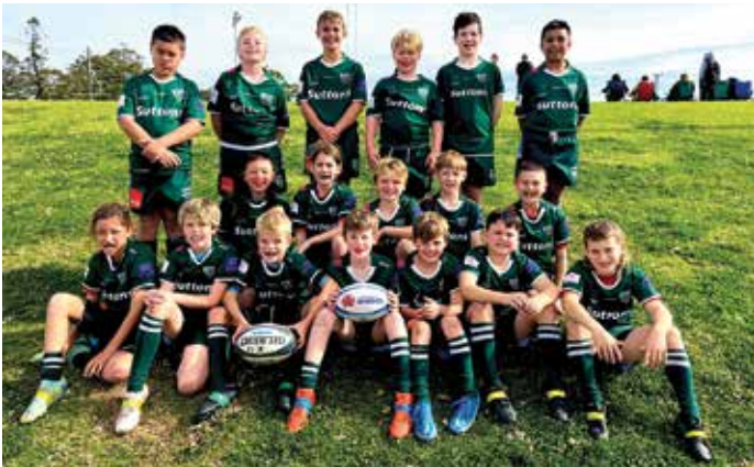
Randwick Representative Team U10 Green