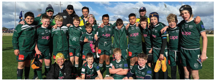
Randwick Representative Team U11 Green