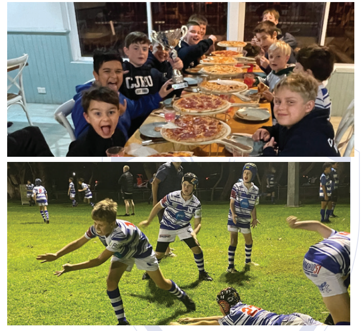
Best Forward: Best Back: Most Improved:

In the meantime, I have no doubt our boys will live by our team motto: NEVER GIVE UP!