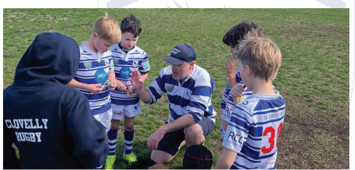
Best Forward: Best Back: Most Improved:

I am already looking forward to next season with the Clovelly Eagles and hope to see many of you in the new year.