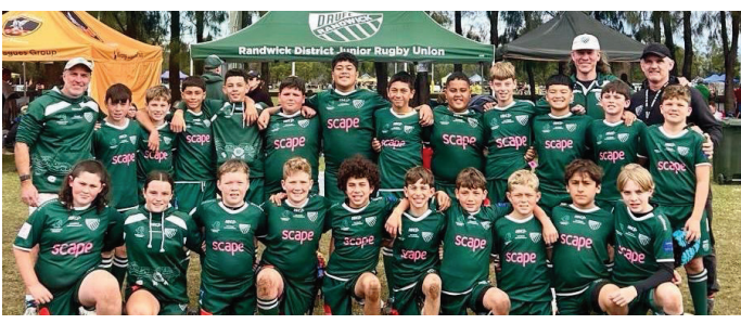
Randwick Representative Team U12