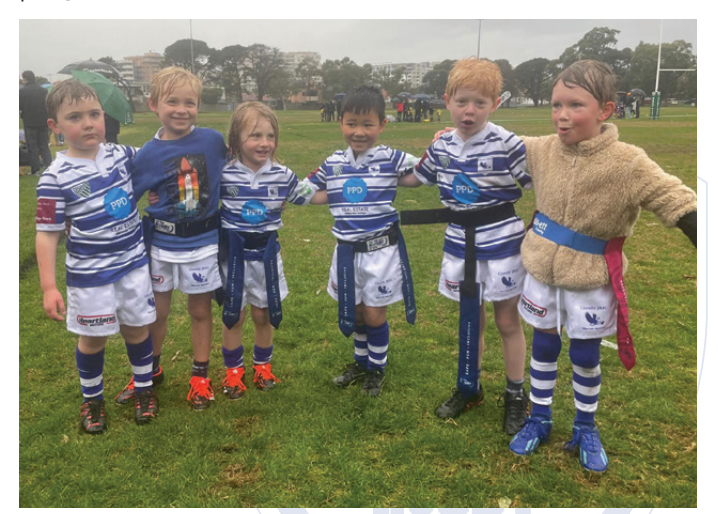
Best Forward: Best Back: Most Improved:

I look forward to seeing you all again next season as we progress to Under 7s!