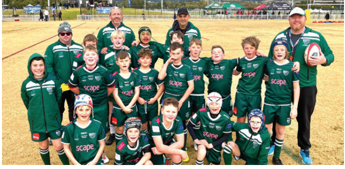
Randwick Representative Team U11 White