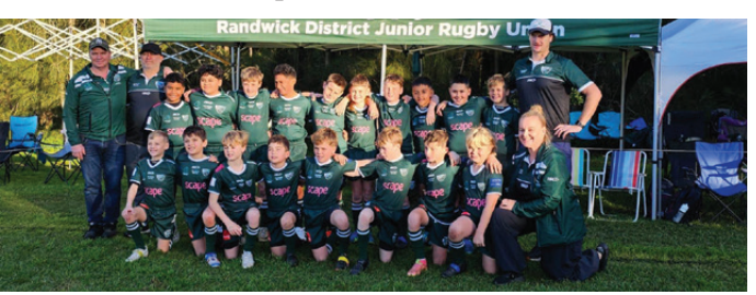
Randwick Representative Team U10 White